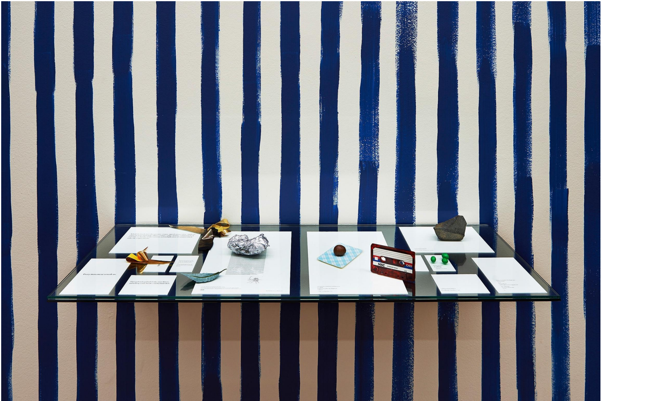
jjjjjjjjjjjjjjjjjjjj (one should always lean backwards whilst typing): exhibition text as part of Lee Welch's solo exhibition, Two exercises in awareness and observation . Sleepwalkers at Dublin City Council The Hugh Lane, July–September 2013.