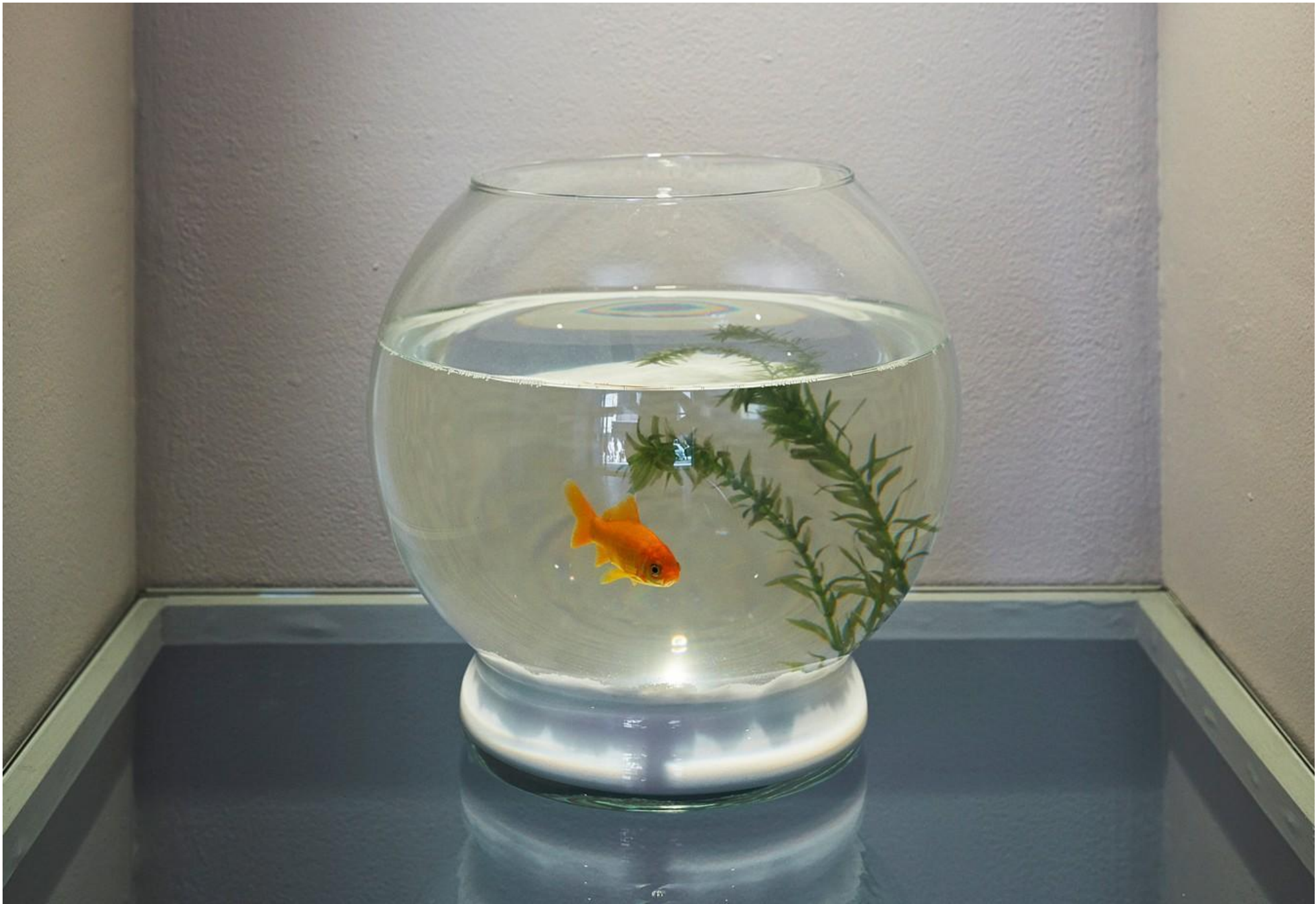
RGKSKSRG, for Project Arts Centre: #5 Response to Barbara Bloom. Project Arts Centre, Dublin, 2014.