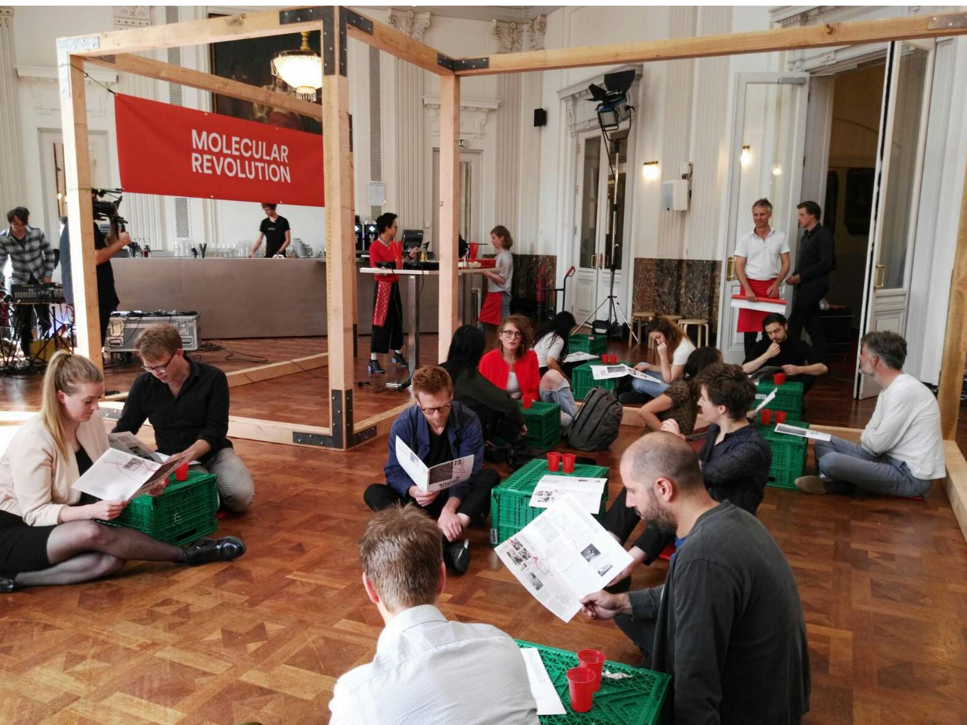
FGFG—A Kitchen Debate no.0, by KVM (Ju Hyun Lee & Ludovic Burel). A live enactment of a printed publication featuring philosofood , the dynamics of collaboration and spicy tofu, presented by RGKSKSRG. PLAYTIME, Kunstvlaai Festival, Amsterdam, Sunday 21 May 2017.