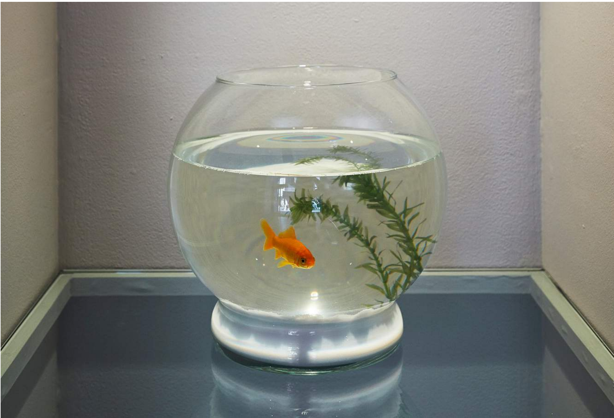
RGKSKSRG, for Project Arts Centre: #5 Response to Barbara Bloom Project Arts Centre, Dublin, 2014.